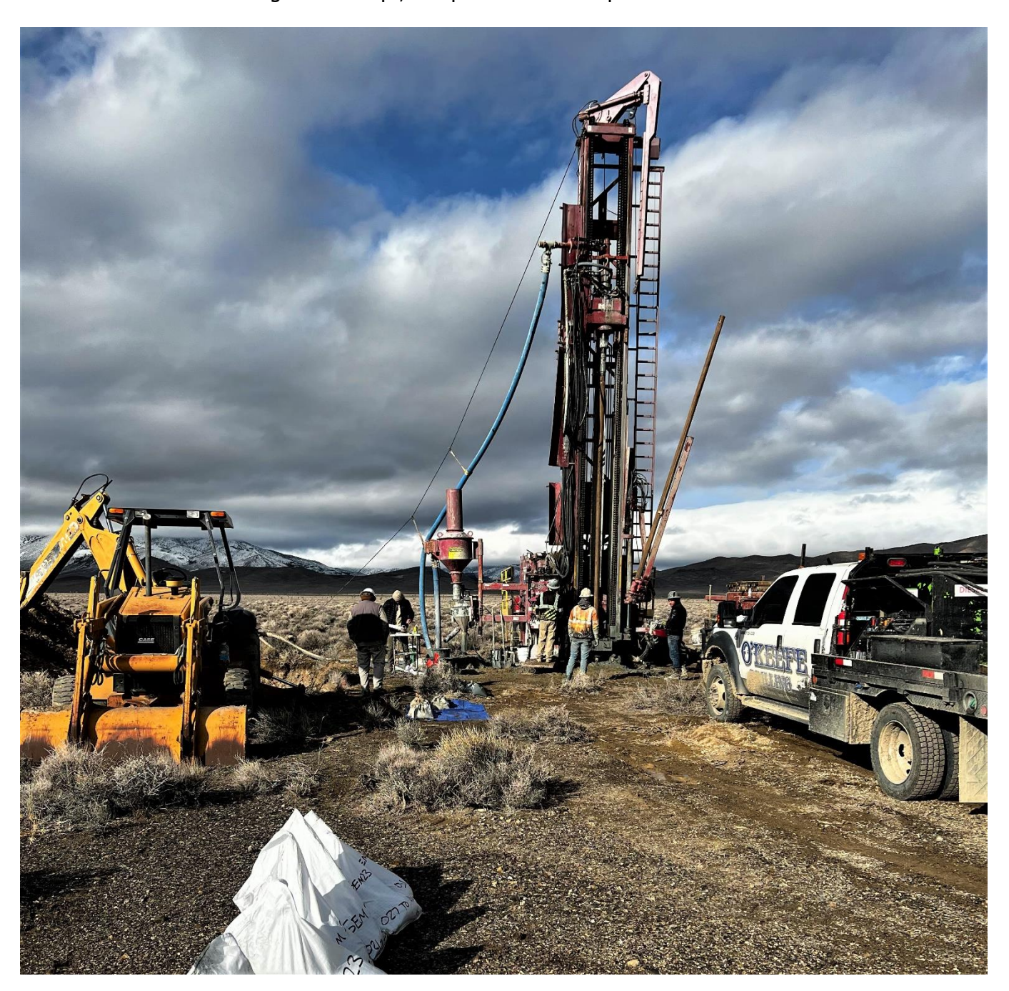
GEM23-04 Drilling in Progress, January 2023

samples to a depth of 810 feet (246.95 metres) was submitted on a rush basis in late November 2022 to American Assay Laboratories in Sparks, Nevada (see Nevada Sunrise news release dated December 6 , 2022 ), which produced results ranging from 615 parts per million ("ppm") lithium to 1,450 ppm lithium. The remainder of the sediment samples from hole GEM22-03 were submitted to ALS Group USA in Reno, Nevada. Thirty-nine groundwater samples were also submitted to Western Environmental Laboratories in Reno, Nevada for analysis. The final results of the sediment and water analyses to the end of hole GEM22-03 will be released following their receipt, compilation and interpretation.